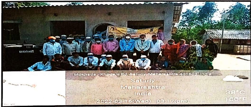
GROUP PHOTO OF TRADITIONAL HEALER INTERACTION PROGRAMME PARTICIPANTS