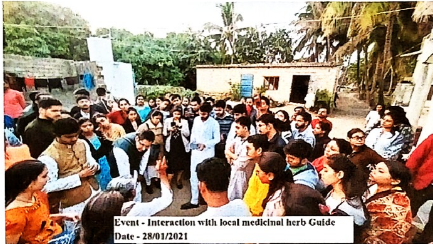
Event - Interaction with local medicinal herb Guide Date - 28/01/2021

Kamal Nagar, Hirawadi, Panchavati, Nashik - 422 003. | Tel.: (0253) 2621565 (College) | (Hosp.) 2518548 Fax : (0253) 2621638 ● E-mail : ssamnsk@gmail.com ● website : www.ssam.in