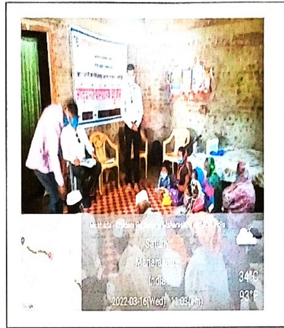
Interaction with Traditional healer